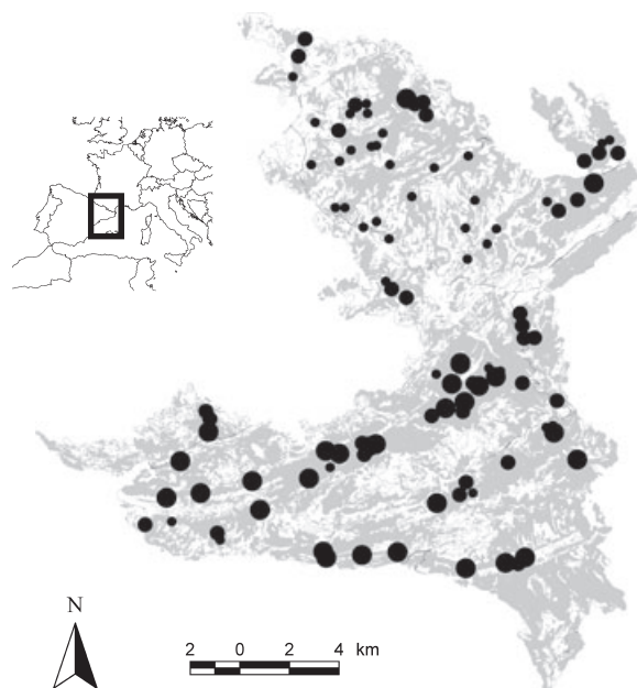
Figure 1. Map of the study area showing locations of transects surveyed ( n = 101 ) for the Ortolan Bunting in 2005, in the area affected by the Solsonès wildfires from 1998. Filled circles of increasing size represent abundance of the species in three classes: 0, 1–2 and 3–6 individuals. The area shown represents burnt habitats, with grey representing burnt forests and white accounting for agricultural areas (mainly cereals).