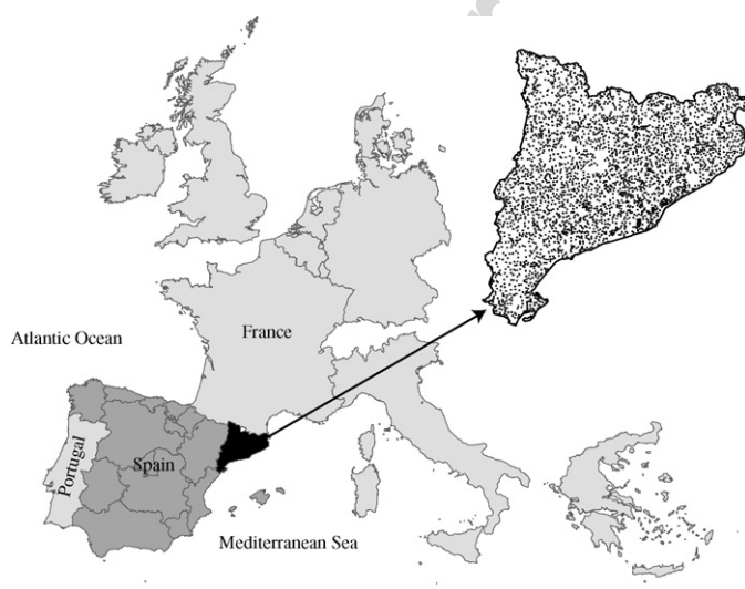
Fig. 1. Geographic location of the study area. Black dots in the enlarged map of Catalonia represent the 2923 UTM 1 km × 1 km cells considered in the study.

Forests represent about 38% of the total area of Catalonia, and about 80% are privately owned (Terradas et al., 2004).